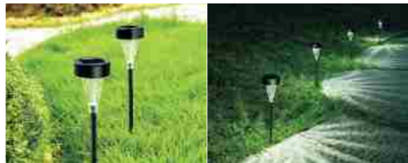
DS001- Spiral pattern style

Design Idea: Inspired by the indispensable umbrella on rainy days, it can shield from the wind and rain, symbolizing brightness and freshness, and the projected light spots are like the rays of the sun, giving people a warm feeling.