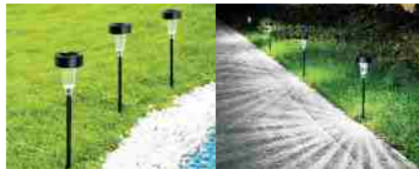
DS001- Vertical strip style

Box Size 200*60*70mm/ 7.87*2.36*2.75in (4pcs/box)