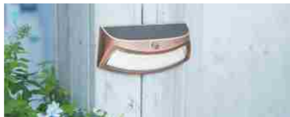
DS-PIR-3688-Copper Light control

Design Idea: Inspired by the shape of the smiling face, the transparent mask is the shape of the mouth, and when the lamp is lit, the combination of the lamp beads and the reflective cup reveals the shape of the teeth. When the lights are on at night, it creates the warm effect of smiling happily.