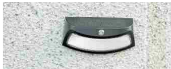
DS-PIR-3688-Black Light control